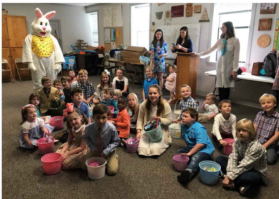
Easter Sunday egg hunt and visit from the Easter Bunny